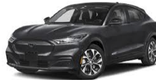
VIN# traced using AutoZone Lookup (Note: Mustang may be a different color. This is for informational purposes only.)

51. The Report then stated that Hisun appeared to have, according to Wolfpack’s findings, only one employee in the United States.